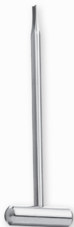
Goldstein Crown Remover Straight GCR0