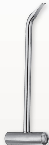
Goldstein Crown Remover 45° Angle GCR45

For cuspids, bicusps, and even first molars.