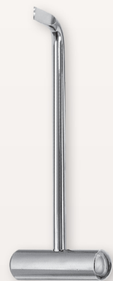
Goldstein Crown Remover Occlusal GCROS

For occlusal separation especially in hard-to-remove crowns that have been bonded to the tooth.